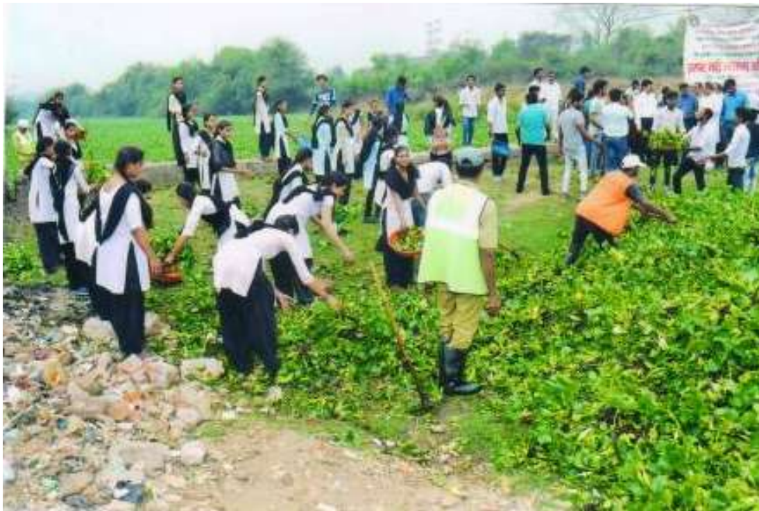
Students of the National Service Scheme of the College while cleaning the river in the Zarpat River Sanitation Campaign on 16th March 2017