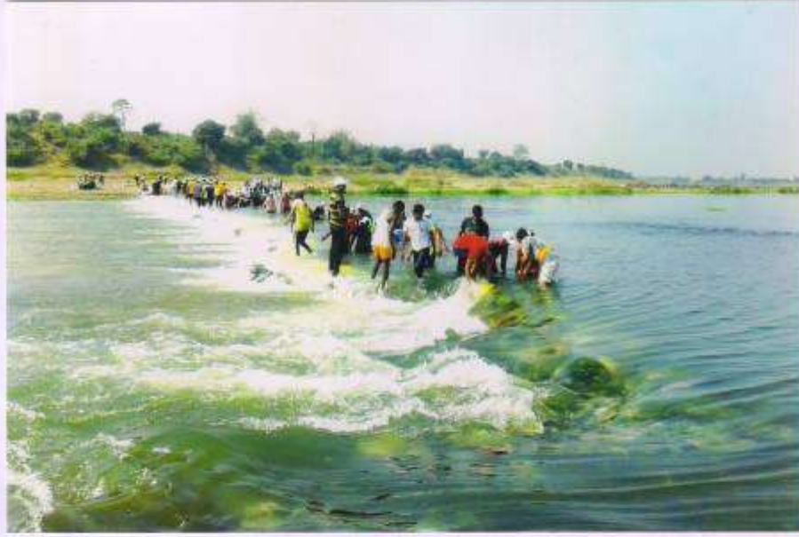
दि. ४ फेब्रुवारी ते १० फेब्रुवारी २०१७ ला ग्रामपंचायत विसापूर येथे वर्शा नदिवर बंधारा बांधतांना विद्यापीठस्तरीय आणि महाविद्यालयीन विशेष शिबिराचे शिबिराध्यक्षसह कार्यक्रम अधिकारी