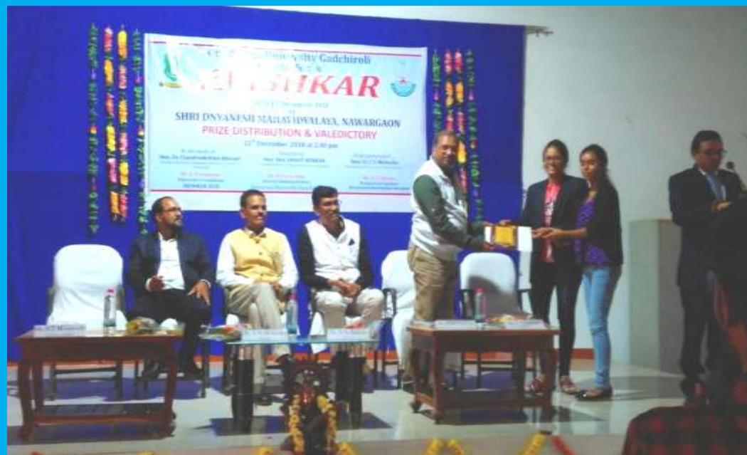
Microbiology and Biotechnology Students of B.Sc. and M.Sc. Represented Gondwana University, Gadchiroli at State Level at Shri Dyanesh Mahvidyalaya, Nawargaon