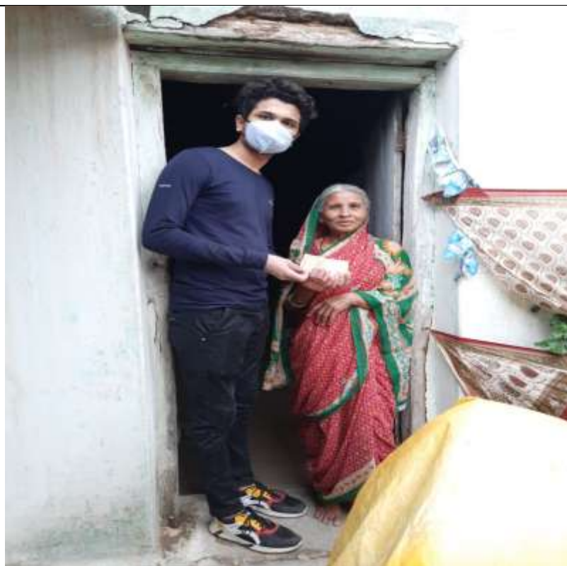
Student Club Members Distributed Grocery items in Rural area On 1 jan 2021