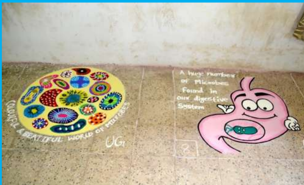
Microbiology Student Club organized Rangoli competition for UG and PG microbiology and Biotechnology students