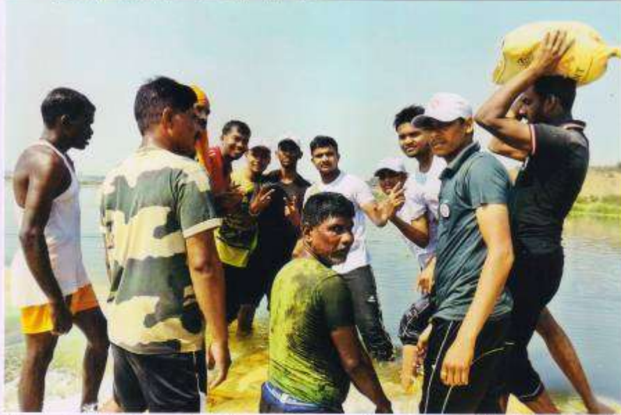
दि. ४ फेब्रुवारी ते १० फेब्रुवारी २०१७ ला ग्रामपंचायत विसापूर येथे वर्धा नदीवर बांधारा बांधतांना महाविद्यालयाचे रा. से. यो. चे शिबिरार्थी

While constructing a dam on the river Wardha at Gram Panchayat Visapur on 4th February to 10th February 2017, the NSS volunteers of the college. with program officer