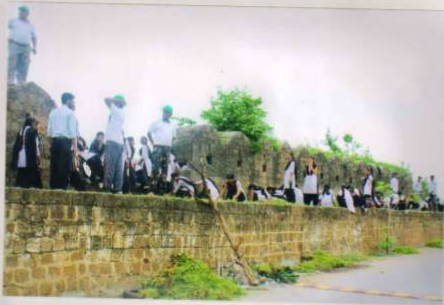
दि. ५ व ६ ऑगस्ट २०१७ रोजी स्वच्छता पखवादा कार्यक्रमअंतर्गत गोंडराजाचे किल्ले, घुसज आणि किल्याच्या परकीटाची स्वच्छता करताना महाविद्यालयाचे रसेयोचे स्वयंसेवक