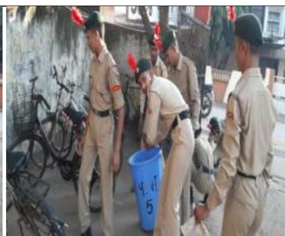
NCC Cadets Cleaning the Campus Area