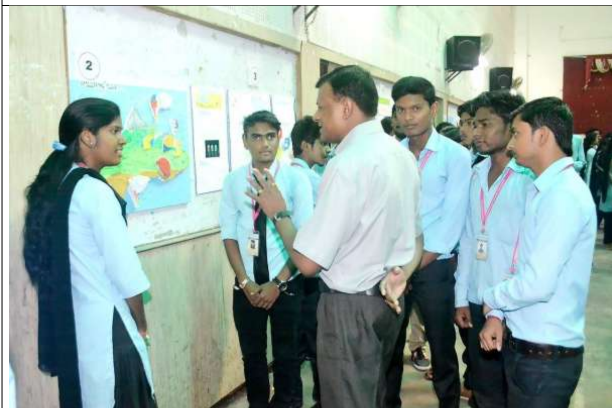
Inauguration of Poster Competition under Computer Club