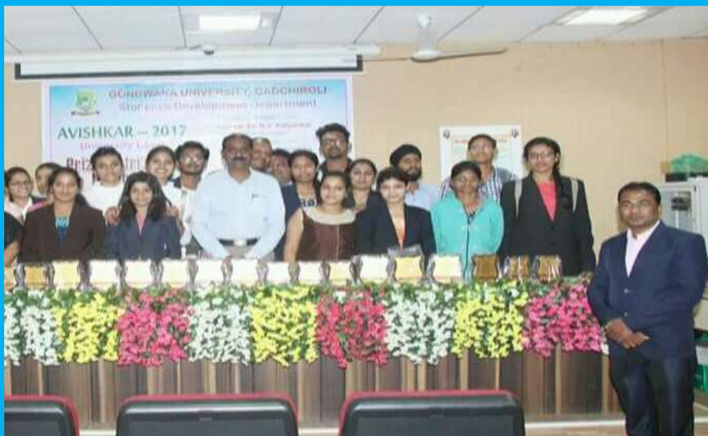
Microbiology and Biotechnology Students of B.Sc. and M.Sc. Represented Gondwana University, Gadchiroli at State Level at Mahatma Phule Krishi Vidhyapeeth, Rahuri, District Ahemadnagar