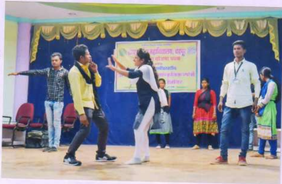
दि. २५ जानेवारी २०१९ रोजी उत्कर्ष सामाजिक व सांस्कृतिक स्पर्धेत पथनाटय करताना स्वयंसेवक