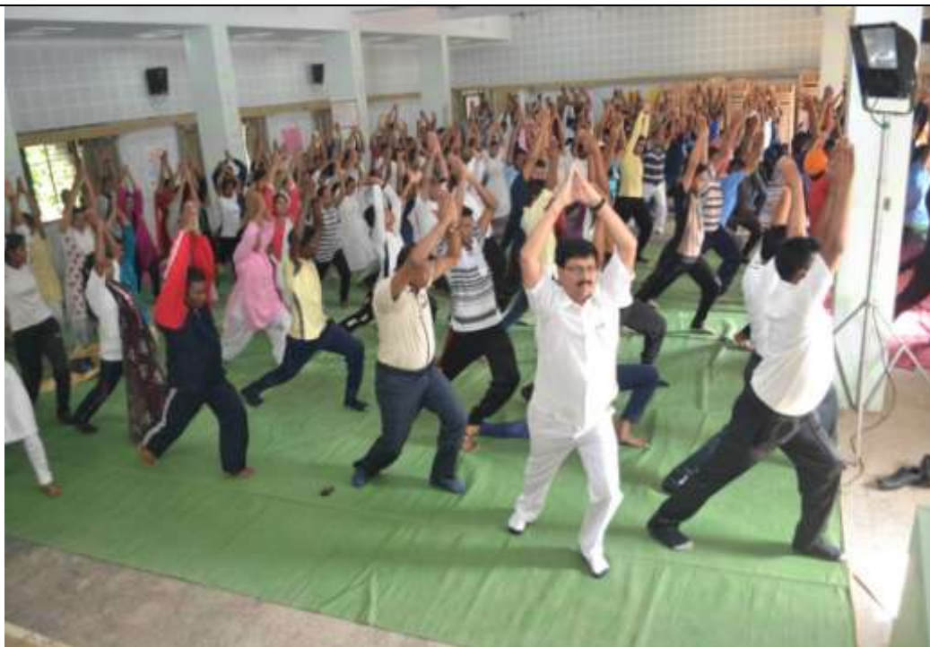
Teaching, Non Teaching Staff, Students Performing Yoga