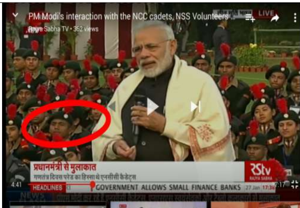
PM MODI'S interaction with the NCC Cadets