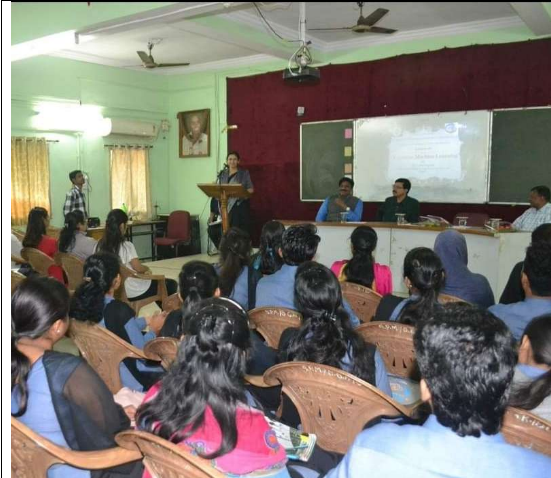
SARDAR PATEL MAHAVIDYALAYA, CHANDRAPUR Session 2019-2020