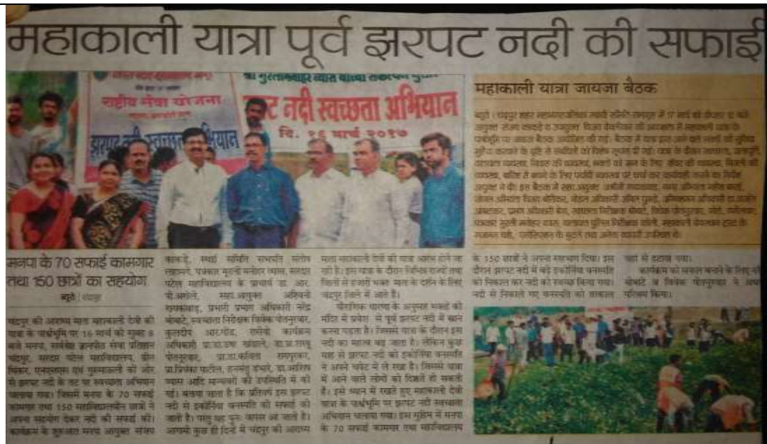
Article covering the Green Thinker's work of Swacta Abhiyan at Zarpat river by newspaper