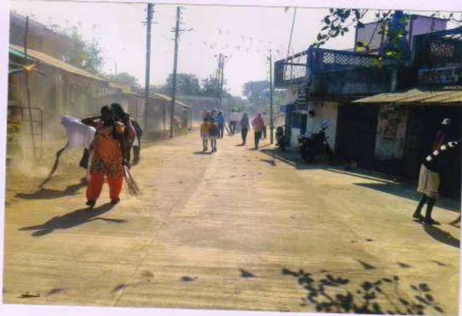
दि. ४ फेब्रुवारी ते १० फेब्रुवारी २०१७ ला ग्रामपंचायत विसापूर येथे गावाची स्वच्छता करताना महाविद्यालयाचे रा. से. यो. चे शिबिरार्थी

While cleaning the village at Gram Panchayat Visapur from 4th February to 10th February 2017, the student of the college.