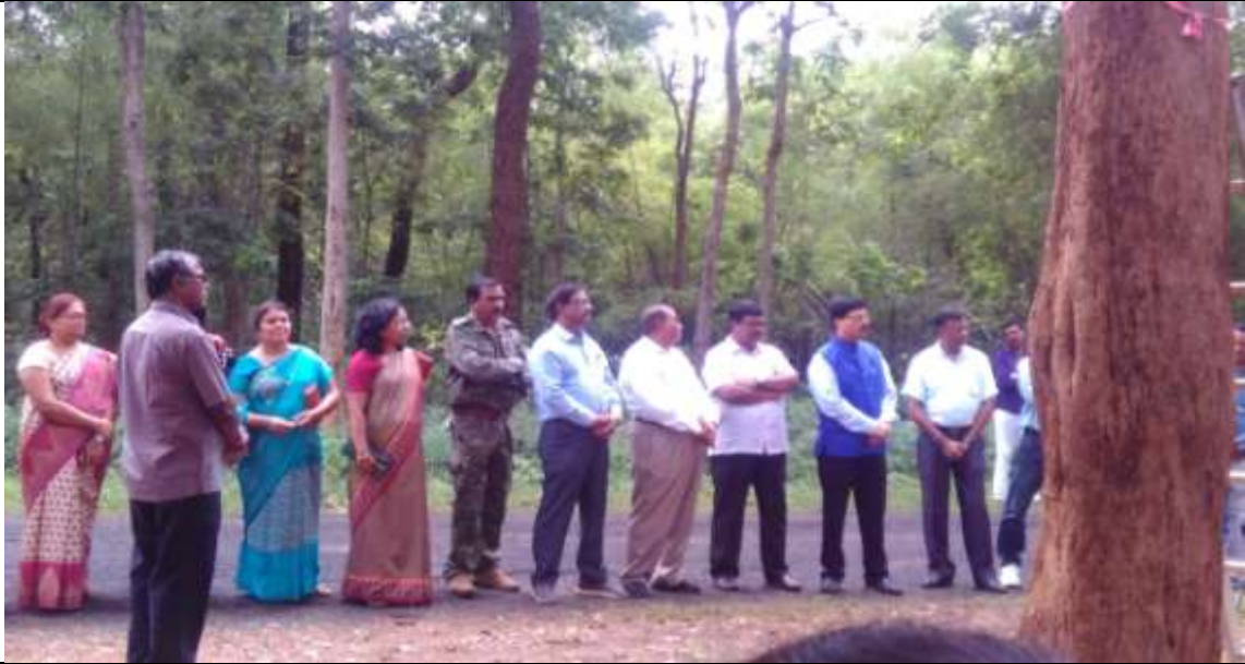
Raksha Bandhan Program in forest