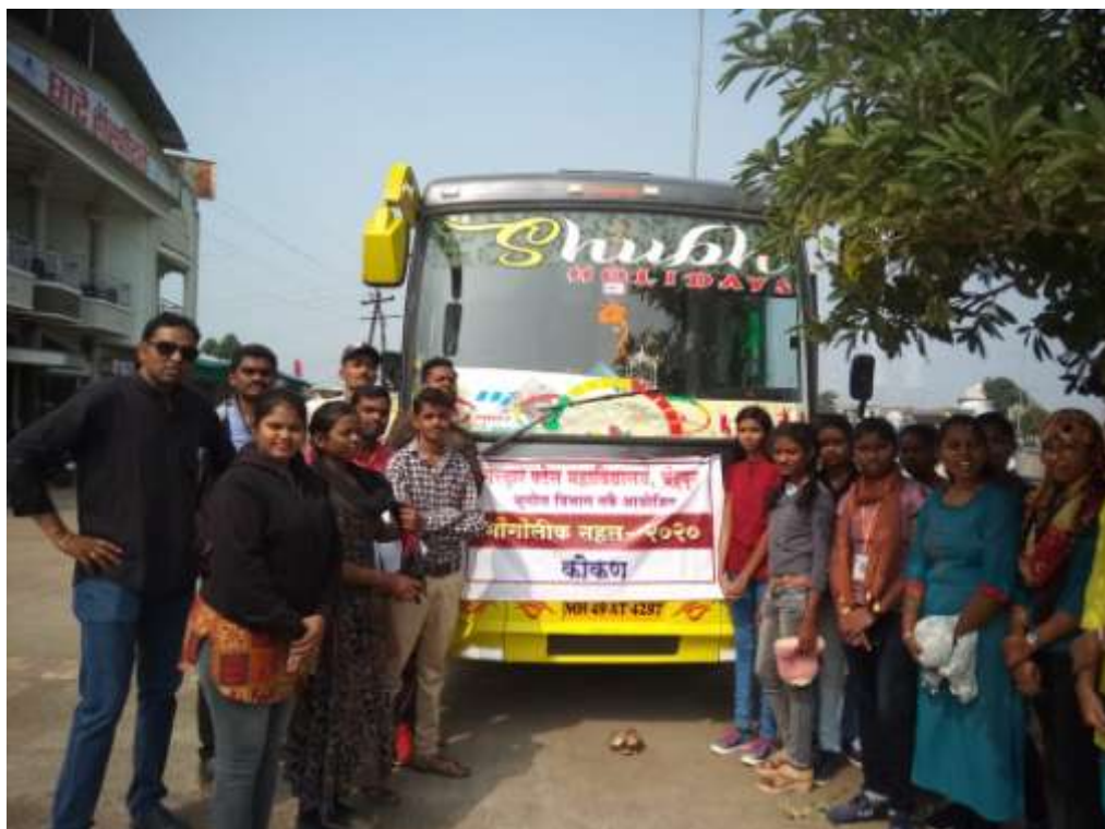
Geographical Konkan Tour 2020