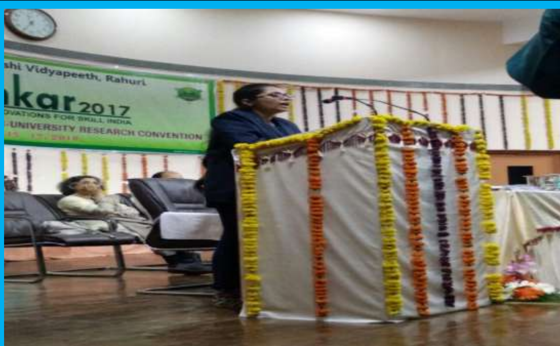
Guest Guiding Student at Avishkar 2017 at Mahatma Phule Krishi Vidhyapeeth, Rahuri, District Ahemadnagar During 15 to 17 January 2018

MICROBIOLOGY STUDENT'S CLUB- ORGANIZED A VALEDICTORY PROGRAMME 2017-2018