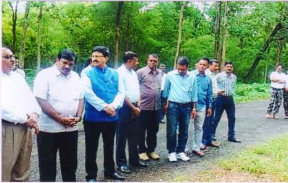
दि. १ सप्टेंबर २०१८ ला इको-प्रो संस्था आणि रासेयो यांच्या संयुक्त विद्यमाने चंद्रपूर वन विभागात वृक्षांची रक्षा करण्याच्या दृष्टीने वृक्ष रक्षाबंधन कार्यक्रम आयोजित करण्यात आले

1. During the period of 4 January to 10 January 2019 volunteer visiting the bamboo tree production in visapur village.