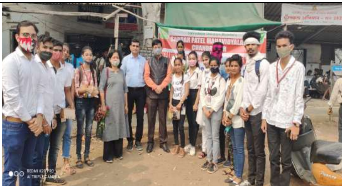
Mask Distribution programmes Organised by Microbial Student Club in Bus Stand, Chandrapur On 5 th FEB 2021