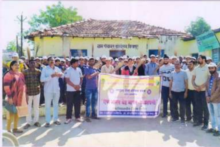
दि. ११ जनवरी ते १७ जनवरी २०२० रासो महाविद्यालयीय विशेष शिविर विस्वापुर गावाची स्वच्छता करताना शिविराची