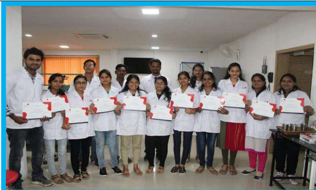
Faculty Members and PG Students has Participated In Workshop By Bioera Life Science Pvt.Ltd., Pune (31 st aug to 2 nd september 2018)