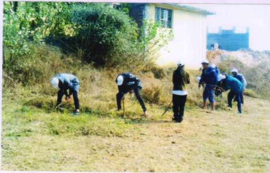
दि. ४ जाने. ते १० जाने. २०१९ या कालावधीत विसापूर गावात स्वच्छता करताना महाविद्यालयीन विशेष शिबीराचे शिविराधी

1·Volunteers rally for cleanness awareness in visapur village during the period of 4 January to 10 January 2019