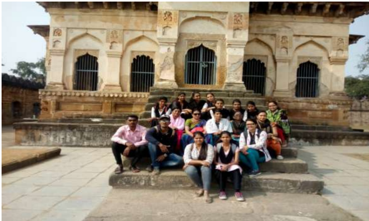
Geography club visits Archeological Anchaleshwar Temple 2020