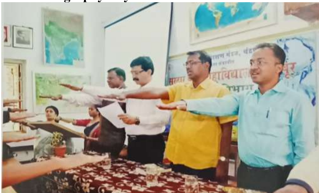
Water Awareness Program 16 - 23 March - 2018