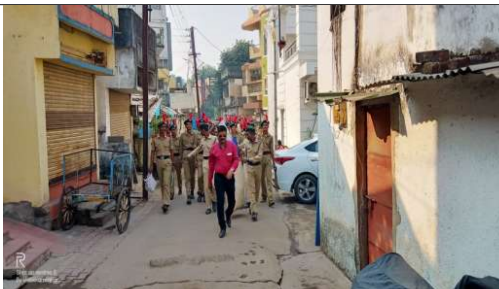
Collected Plastic under Swatchata Pandarwada Campaign form Street