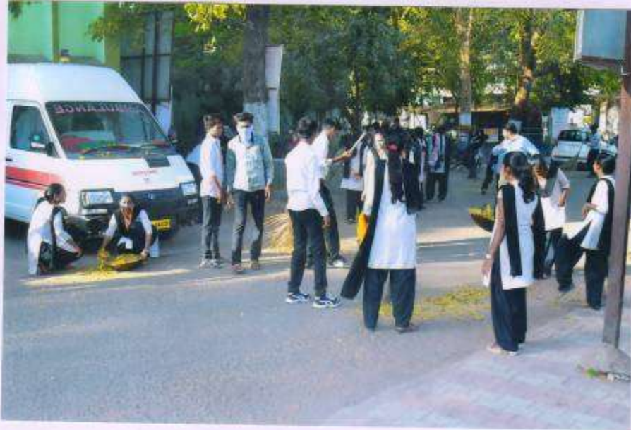
दि. २३ फेब्रुवारी २०१७ ला गाडगेबाबा जयंती निमित्त स्वच्छता अभियान अंतर्गत जिल्हा सामान्य रुग्णालयात स्वच्छता करताना महाविद्यालयाचे राष्ट्रीय सेवा योजनेचे विद्यार्थी