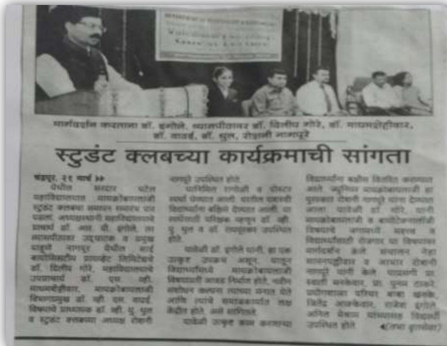
Tarun Bharat dated on 22 March 1918