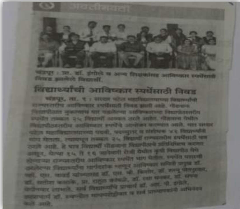
Sakal dated on 10 January 1918