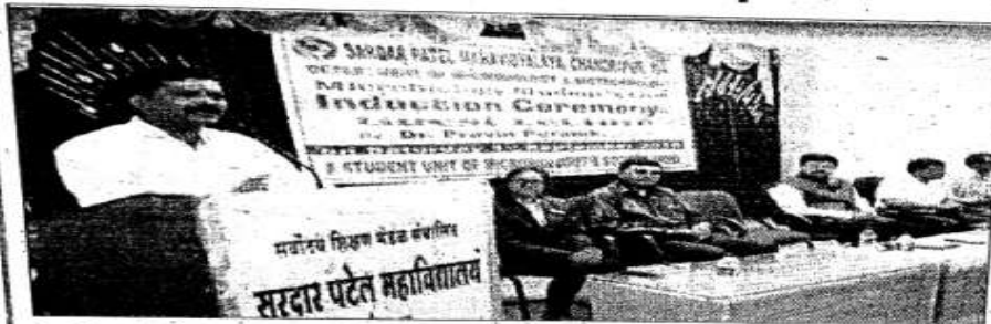
A dignitary addressing the programme.