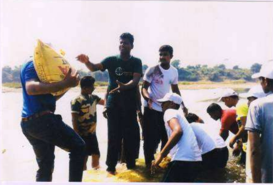
दि. ४ फेब्रुवारी ते १० फेब्रुवारी २०१७ ला ग्रामपंचायत विसापूर येथे वर्धा नदीवर बांधारा बांधतांना महाविद्यालयाचे रा. से. यो. चे कार्यक्रम अधिकारी सोबत शिबिरार्थी