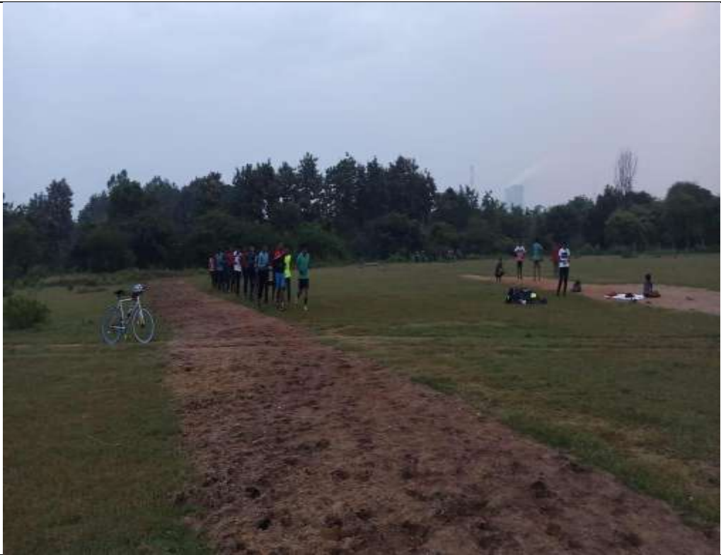
Fit India Movement run by Department of NCC to Serve in Covid -19