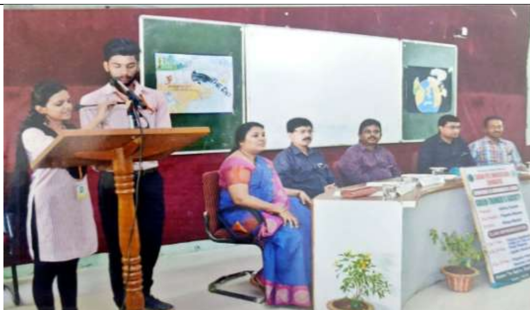
Inaugural Function of Green Thinker's Society in Session 2018-2019