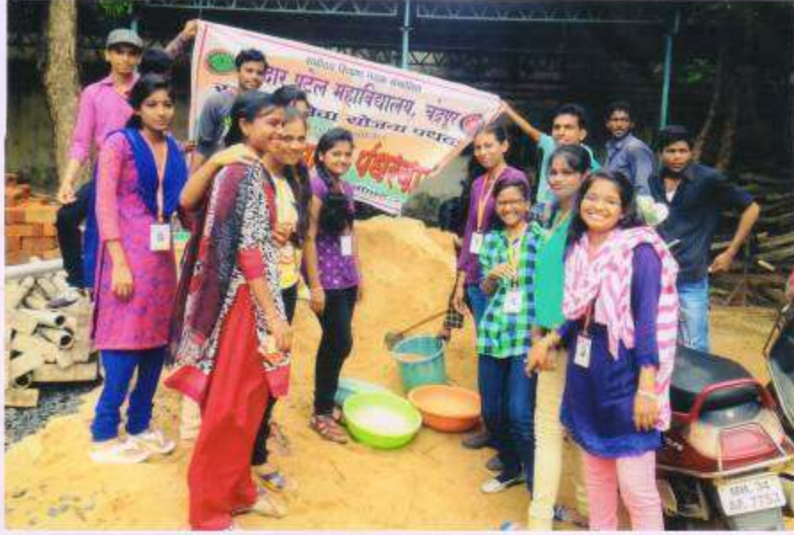
दि. ४ फेब्रुवारी ते १० फेब्रुवारी २०१७ ला ग्रामपंचायत विसापूर येथे गावाची स्वच्छता करताना महाविद्यालयाचे रा. से. यो. चे शिबिरार्थी