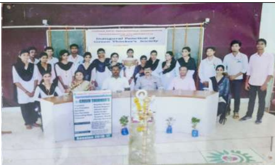
Inaugural Function of Green Thinker's Society in session 2016-2017