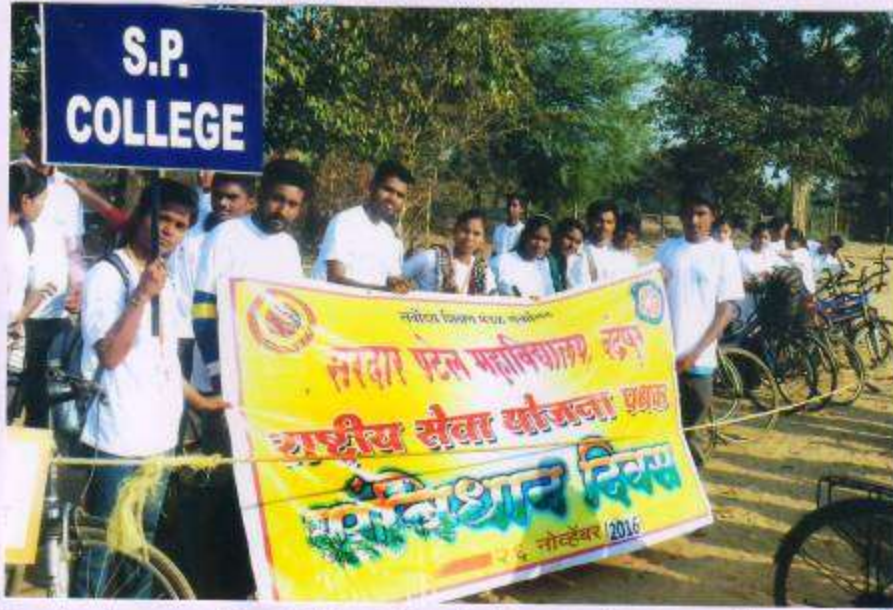
दि. ३ फेब्रुवारी २०१७ ला हिंदुस्तान पेट्रोलियम कॉर्पोरेशन लिमिटेड द्वारा आयोजित सायकल रॅलीत सहभागी झालेले महाविद्यालयाचे राष्ट्रीय सेवा योजनेचे विद्यार्थी