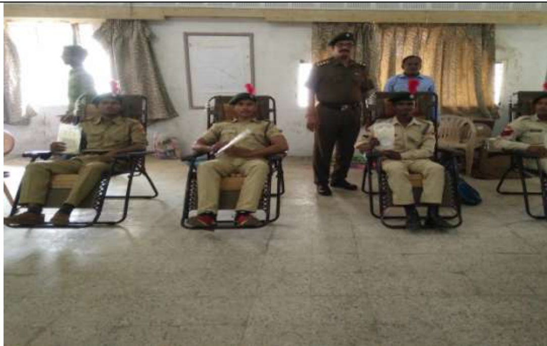
NCC Cadets Donated Blood in Blood Donation Camp in our College