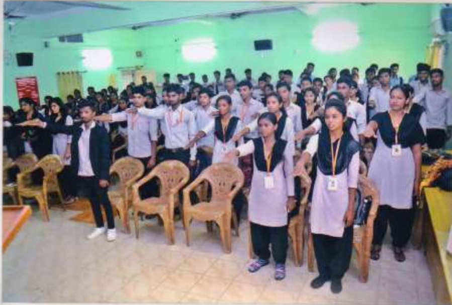
दि. २४ सप्टेंबर २०१७ रोजी राष्ट्रीय सेवा योजना दिवस पर सपथ देताना स्वयंसेवक