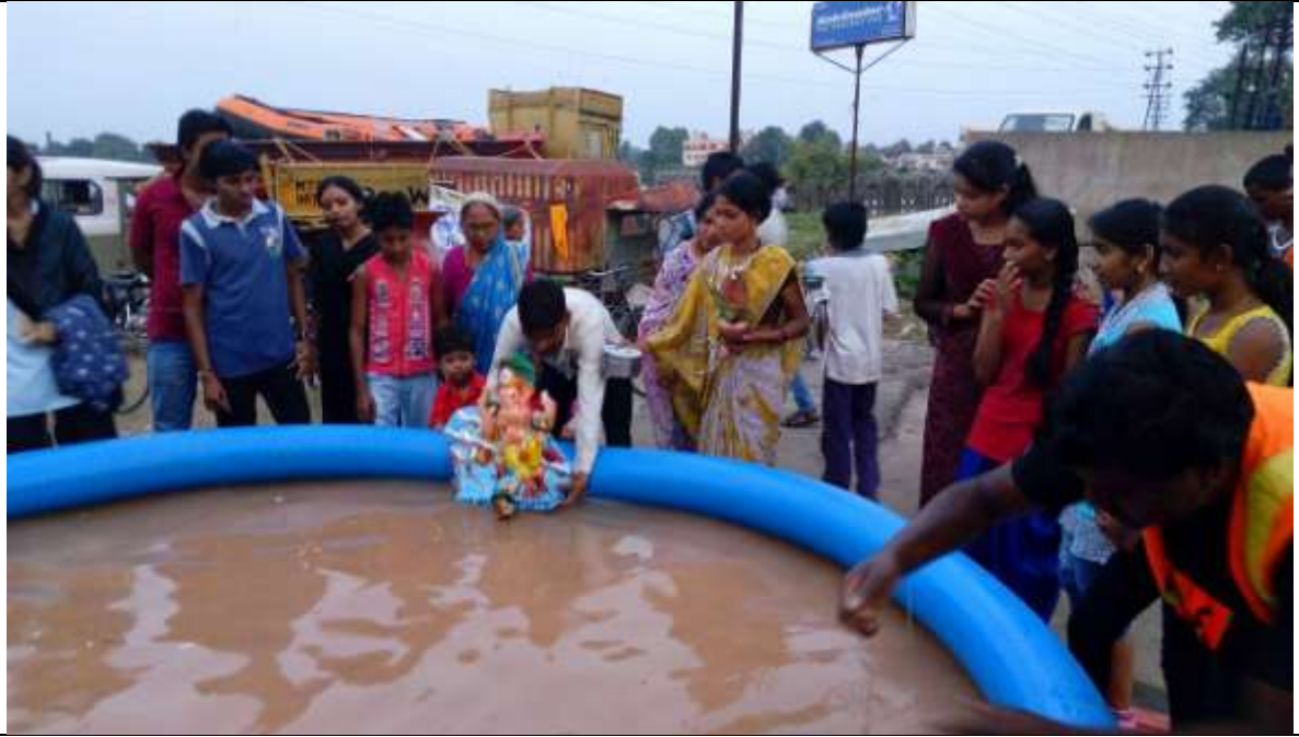
Students creating awareness at Ganesh visergen