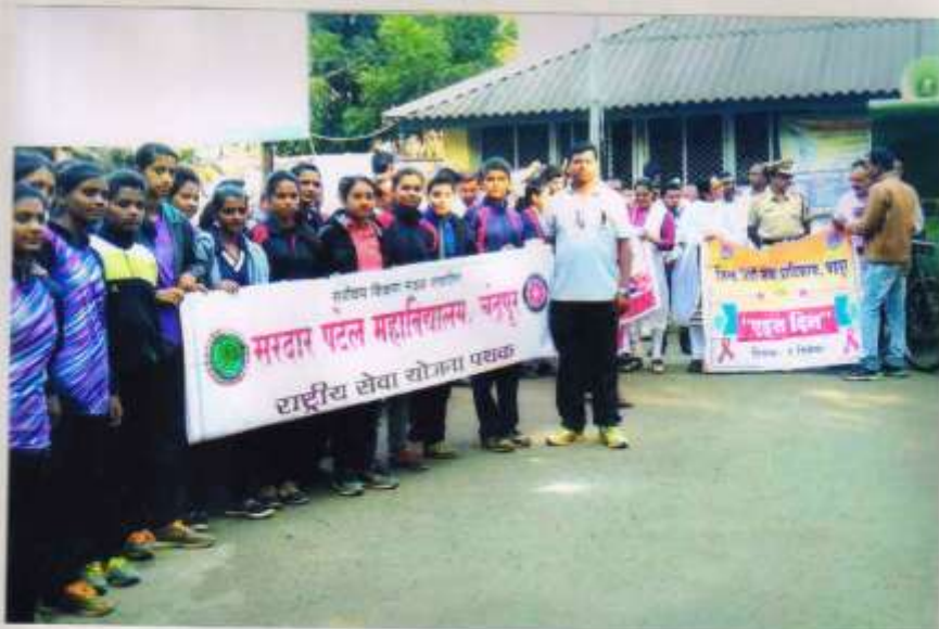
दि. १ डिसेंबर २०१७ रोजी आंतरराष्ट्रीय एड्स दिवस रॅलीत सहभाग घेतांना कार्यक्रम अधिकारी व स्वयंसेवक