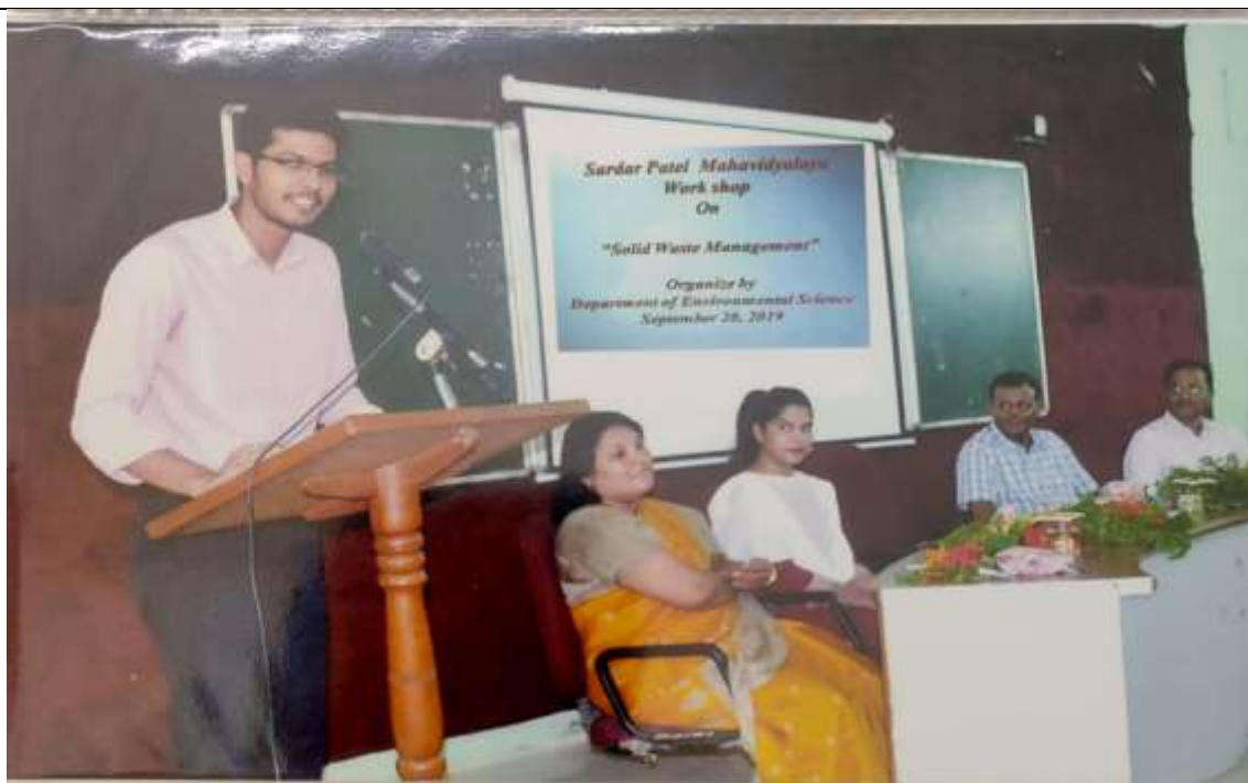
Workshop on 'Solid Waste Management' collaboration with Municipal Corporation, Chandrapur

SARDAR PATEL MAHAVIDYALAYA, CHANDRAPUR DEPARTMENT OF MICROBIOLOGY