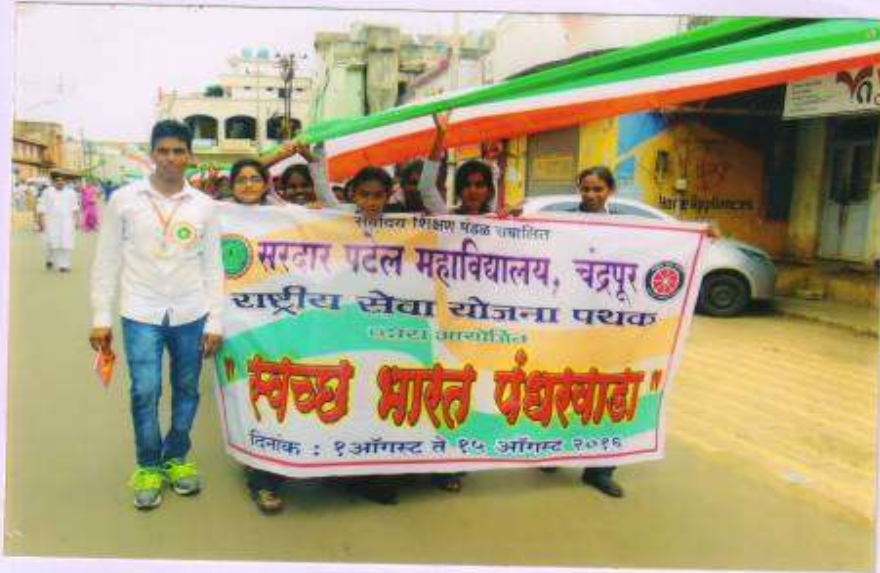
१५ ऑगस्ट २०१६ ला तिरंगा रॅलीत सहभाग घेतलेले राष्ट्रीय सेवा योजनेचे विद्यार्थी