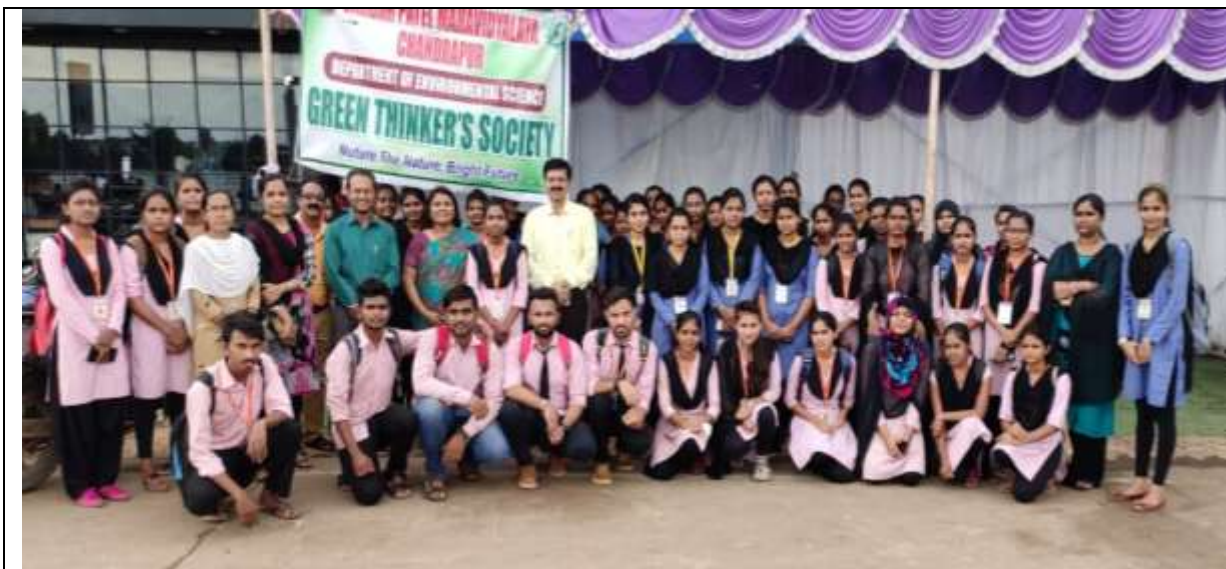
Awareness campaign at Ramala Lake during Idol Immersion