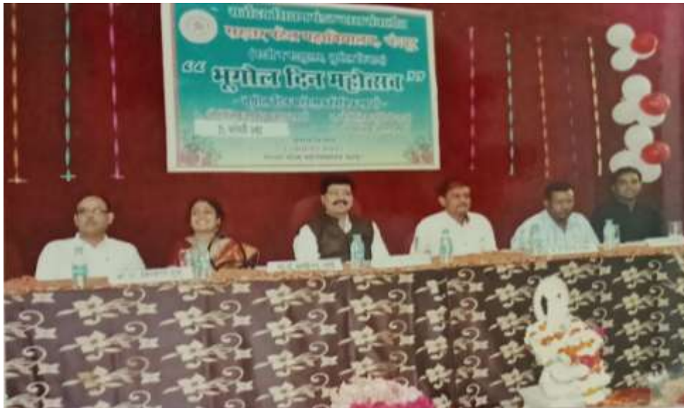
Geography Day Celebration – 15 Jan 2018