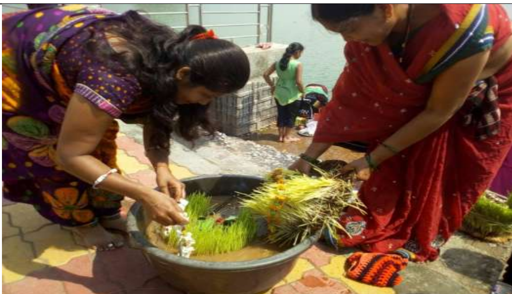
Gauri pooja immersion in a small tub during Gauri pooja festival at Ramala Lake