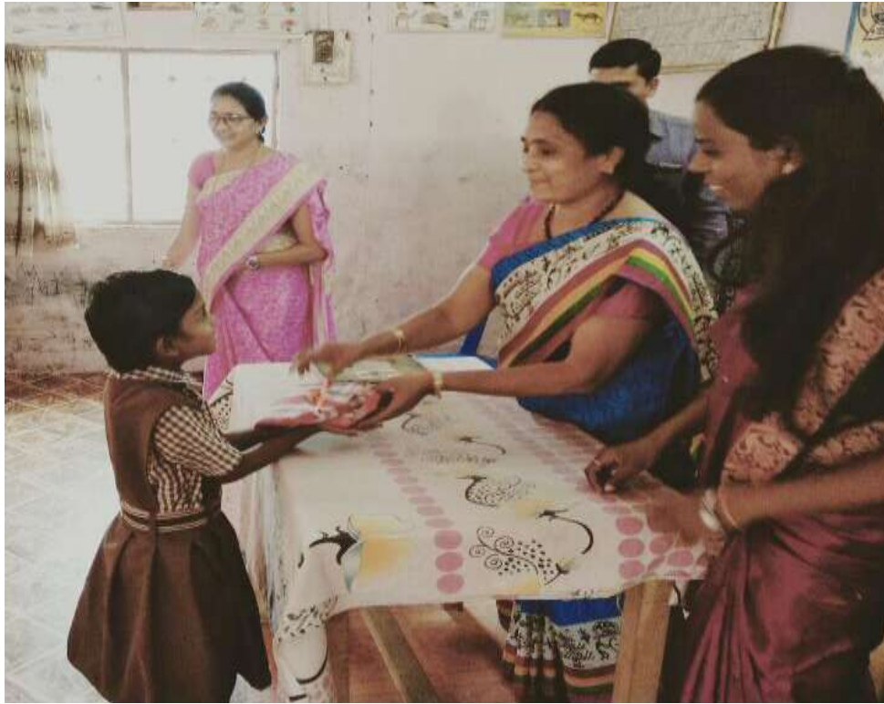
Geography club visits Deaf and Dump Govt. School, Babupeth, Chandrapur 2018