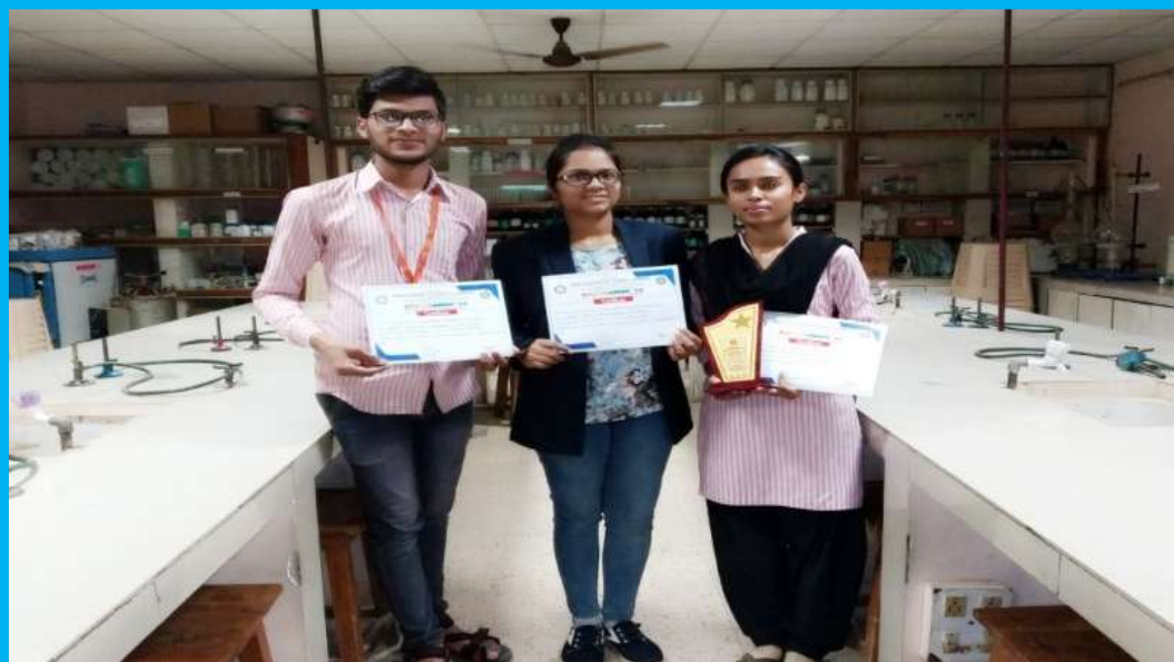
UG Students Participated in “ Scintillation 19 ” state level Seminar held at J.B. Sceince College, wardha and got first and Second Concellation prize on 18 th March 2019