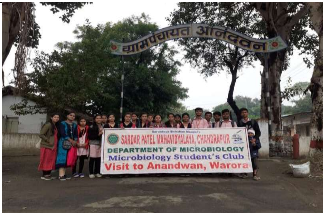
Microbiology Student club Members visited to Anandwan, Warora on 1 st JAN 2020