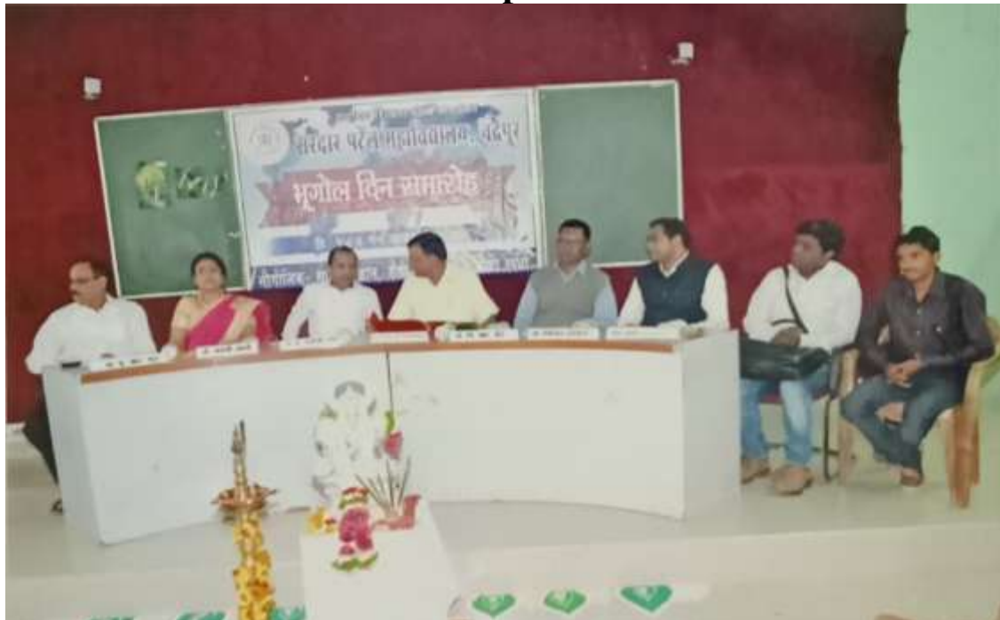
Geography Day Celebration – 14 & 15 Jan 2019