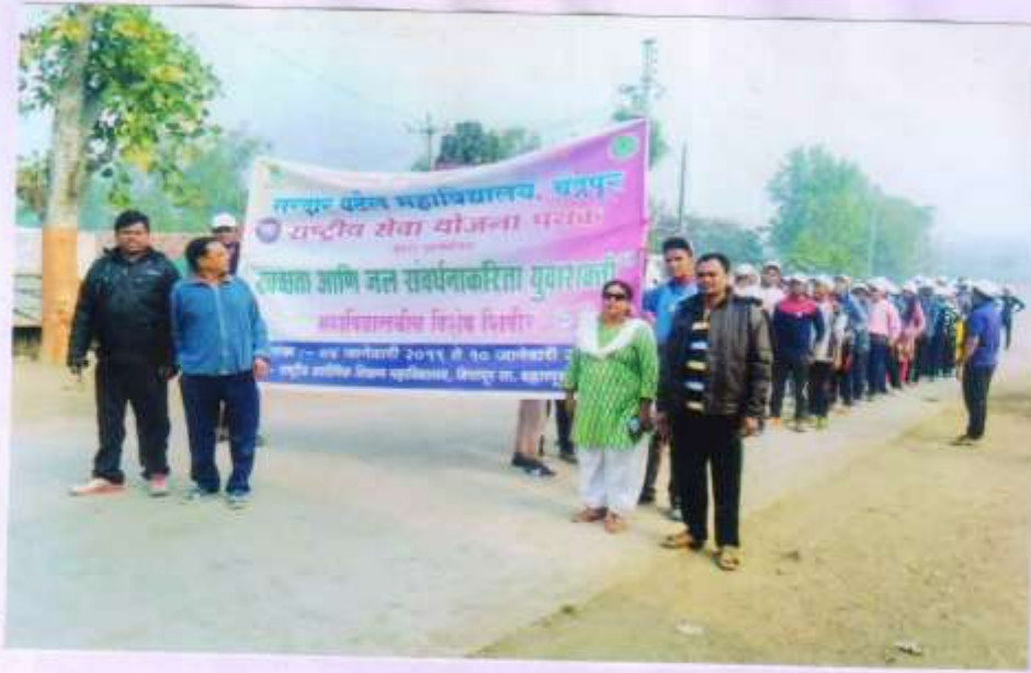
दि. ४ जाने. ते १० जाने. २०१९ या कालावधीत विसापूर गावात स्वच्छतेची रॅली करताना महाविद्यालयीन विशेष शिबीराचे शिविराधी