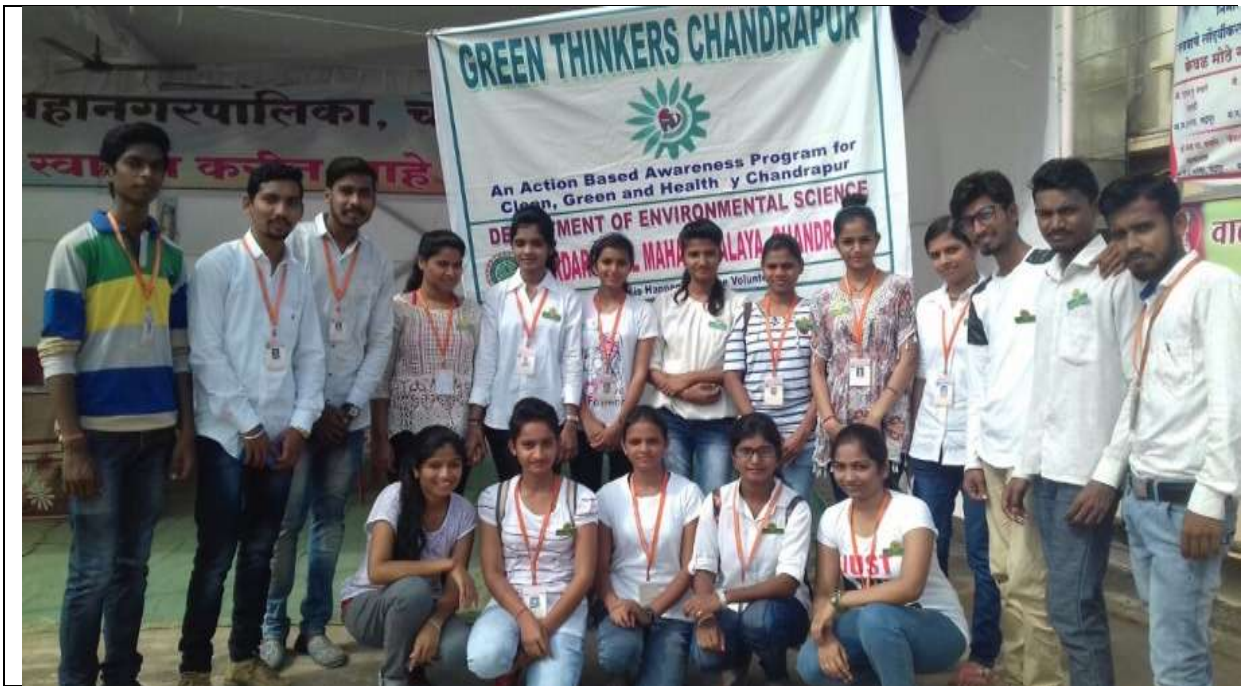
Awareness campaign at Ramala Lake during Idol immersion