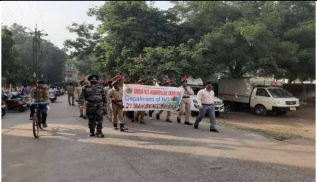
Rally to aware people about Cleanliness under Swatchata Pandarwada