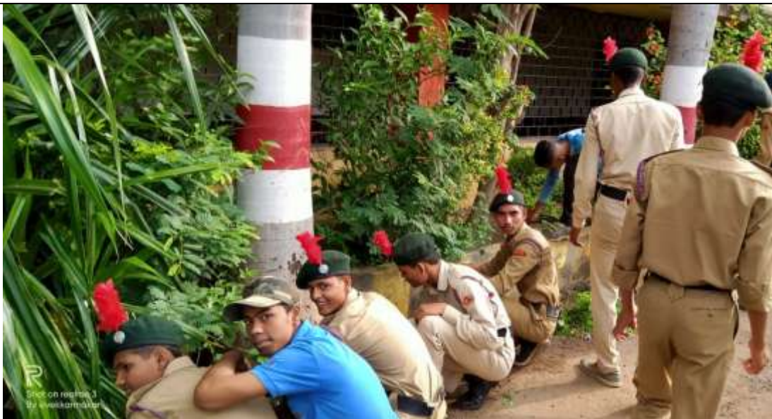
Cadets Cleaning the Campus Area