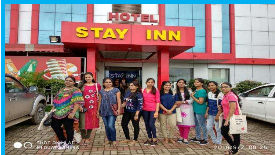
Excursion Tour Was Organized For M.Sc Students during 30 th August 2018 to 3 rd September 2018 (Shaniwarwada, Rajiv Gandhi Zoological park, Pune)