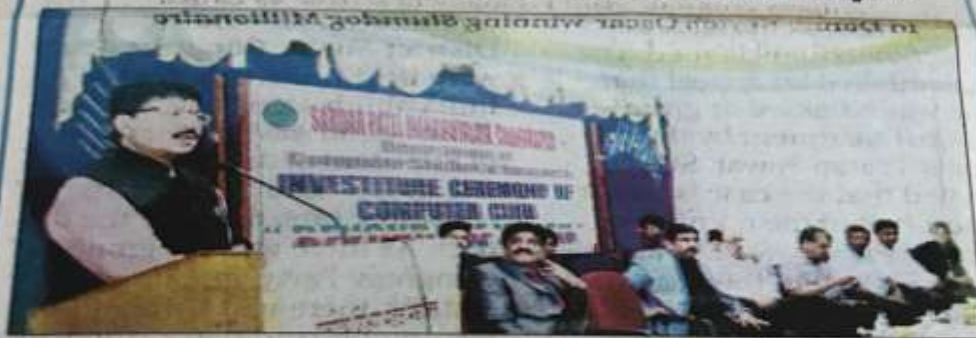
A guest addressing the programme.