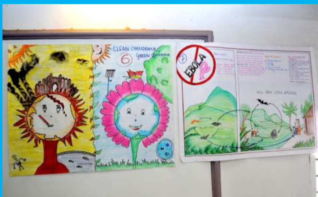
Microbiology Student Club organized poster competition for UG and PG microbiology and Biotechnology students