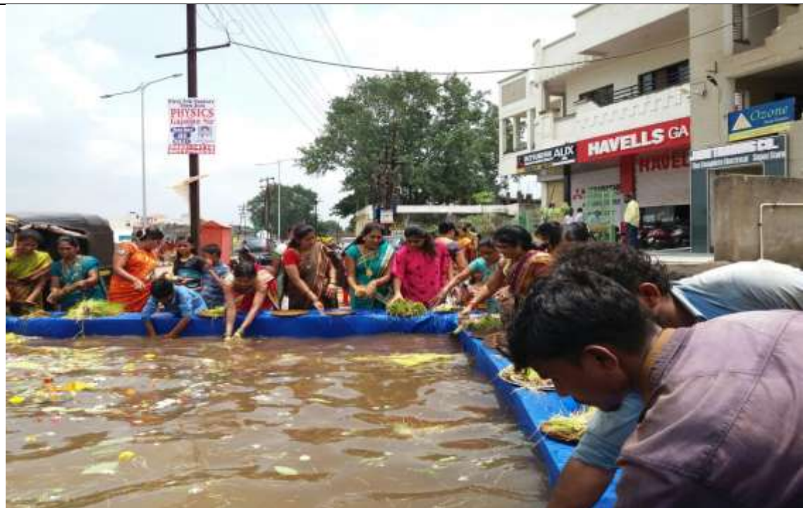
Students creating awareness during Ganesh Visergen