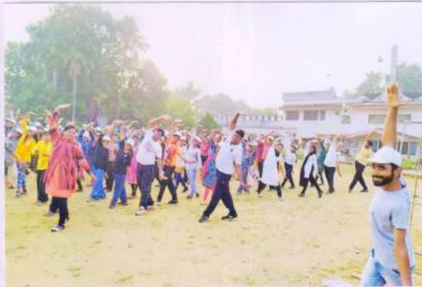
दि. ११ जानेवारी ते १७ जानेवारी २०२० पर्यंत रायेसो महाविद्यालयीन विशेष शिबिरात योगनृत्य करताना कार्यक्रम अधिकारी व शिबिराधी