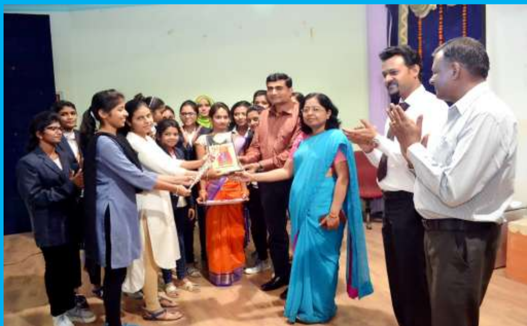
Microbiology Student Club members presented memento to department on completion of 5 th year of Microbiology Student Club