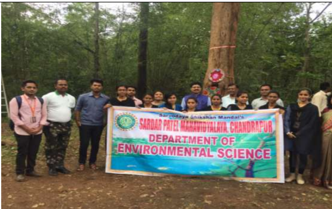
Celebrating Raksha Bandhan festival with Trees