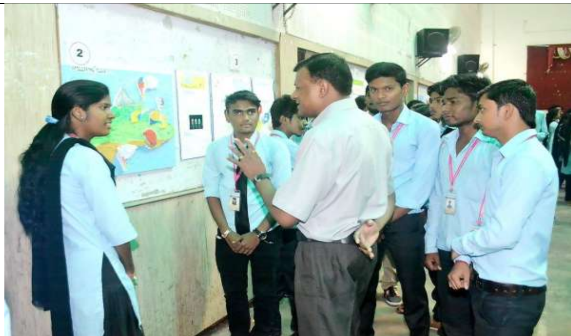
Inauguration of Poster Competition under Computer Club