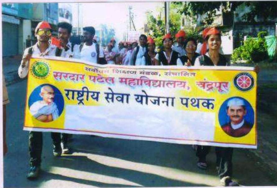
दि. २५ फेब्रुवारी २०१७ ला राष्ट्रसंत तुकडोजी महाराज साहित्य संमेलनातील प्रथदिंडी रॅलीमध्ये सहभागी झालेले महाविद्यालयाचे राष्ट्रीय सेवा योजनेचे विद्यार्थी

On Students of National Service Scheme of the College who participated in the Cycle Rally organized by Hindustan Petroleum Corporation Limited on 3 February 2017