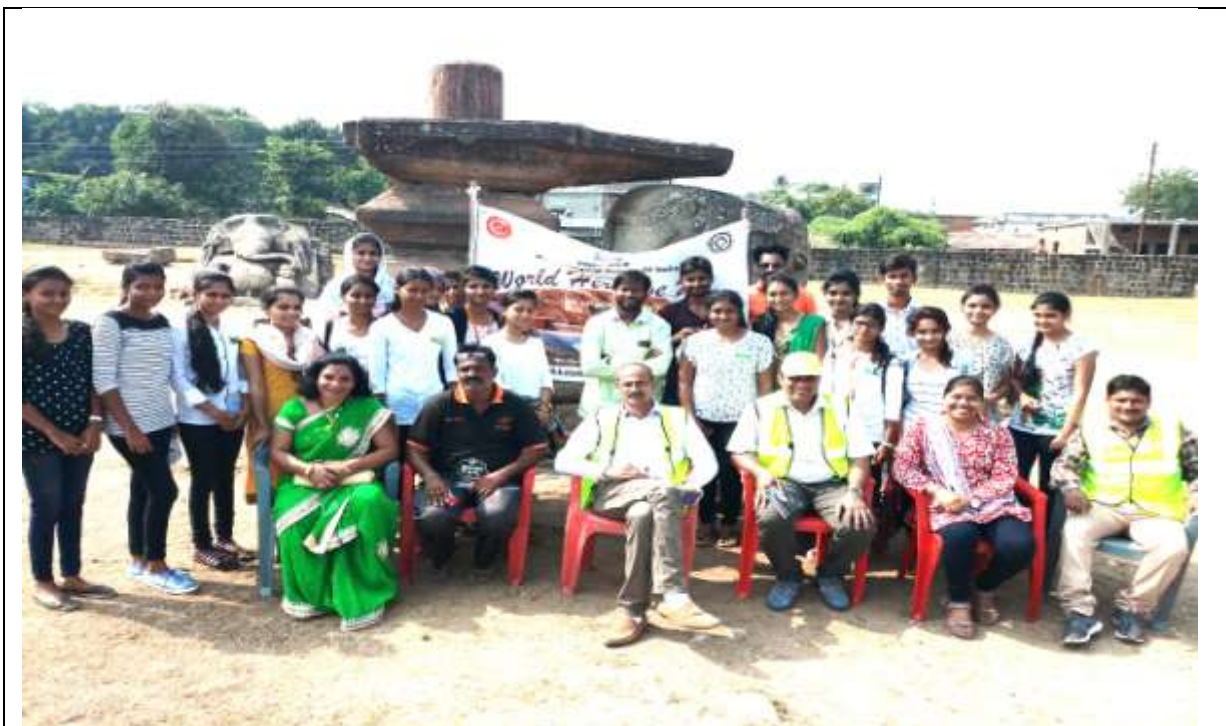
Green thinker's students involved in Swachta Abhiyan in Historical Palace of Chandrapur city