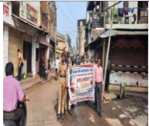
Awareness Rally for Blood Donation Camp