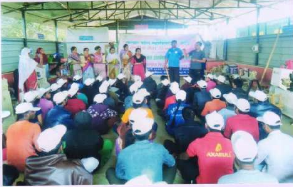
दि. ४ जाने. ते १० जाने. २०१९ या कालावधीत विसापूर गावात बांबू प्रशिक्षण घेतांना महाविद्यालयीन विशेष शिबीराचे शिबिरार्थी