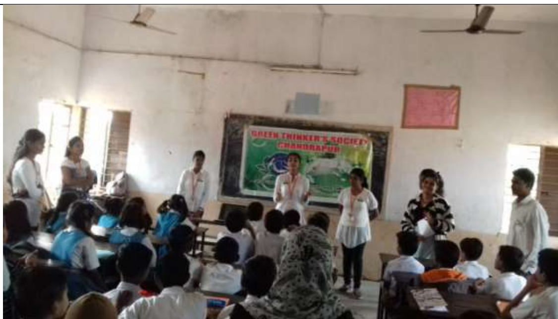
Green thinker's creating awareness among school students