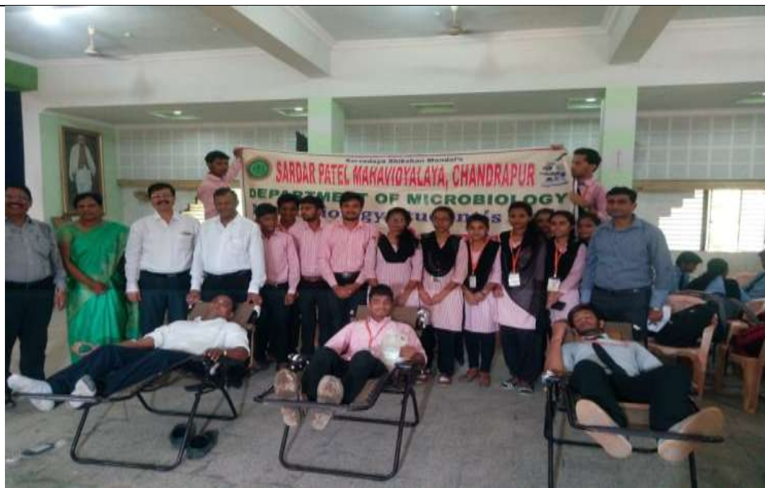
Member of MB student club has actively participated in “ Blood Donation Camp ” in S.P.College Sept 2019