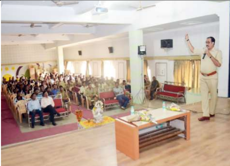
Trainer of Traffic Office giving important tips of Traffic