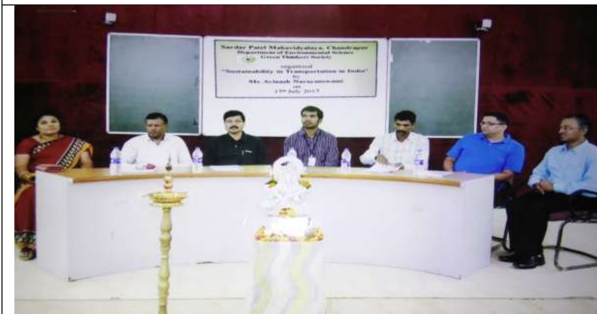
Dignitaries on the dais during the workshop on Biodiesel-“Sustainability in Transportation in India” organized by the Department of Environmental Science